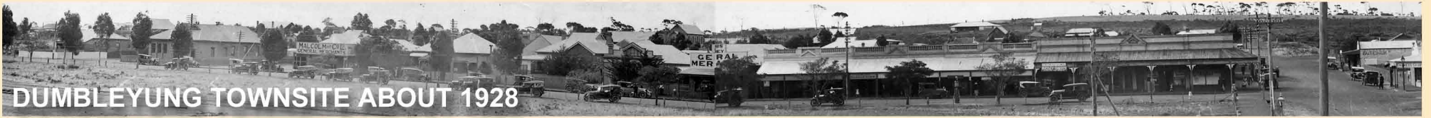
DUMBLEYUNG TOWNSITE ABOUT 1928